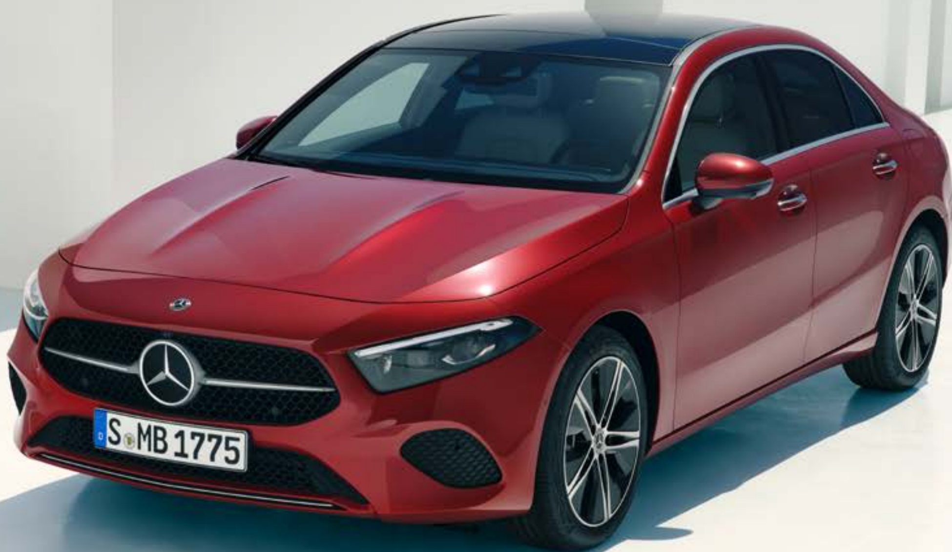
Photo may vary from actual unit.