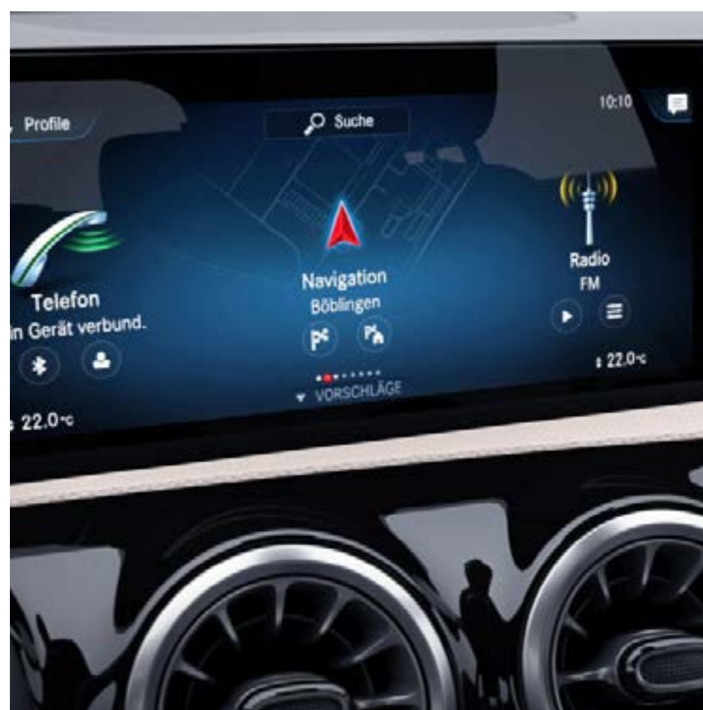
High resolution MBUX Multimedia System with 10.25-inch touchscreen