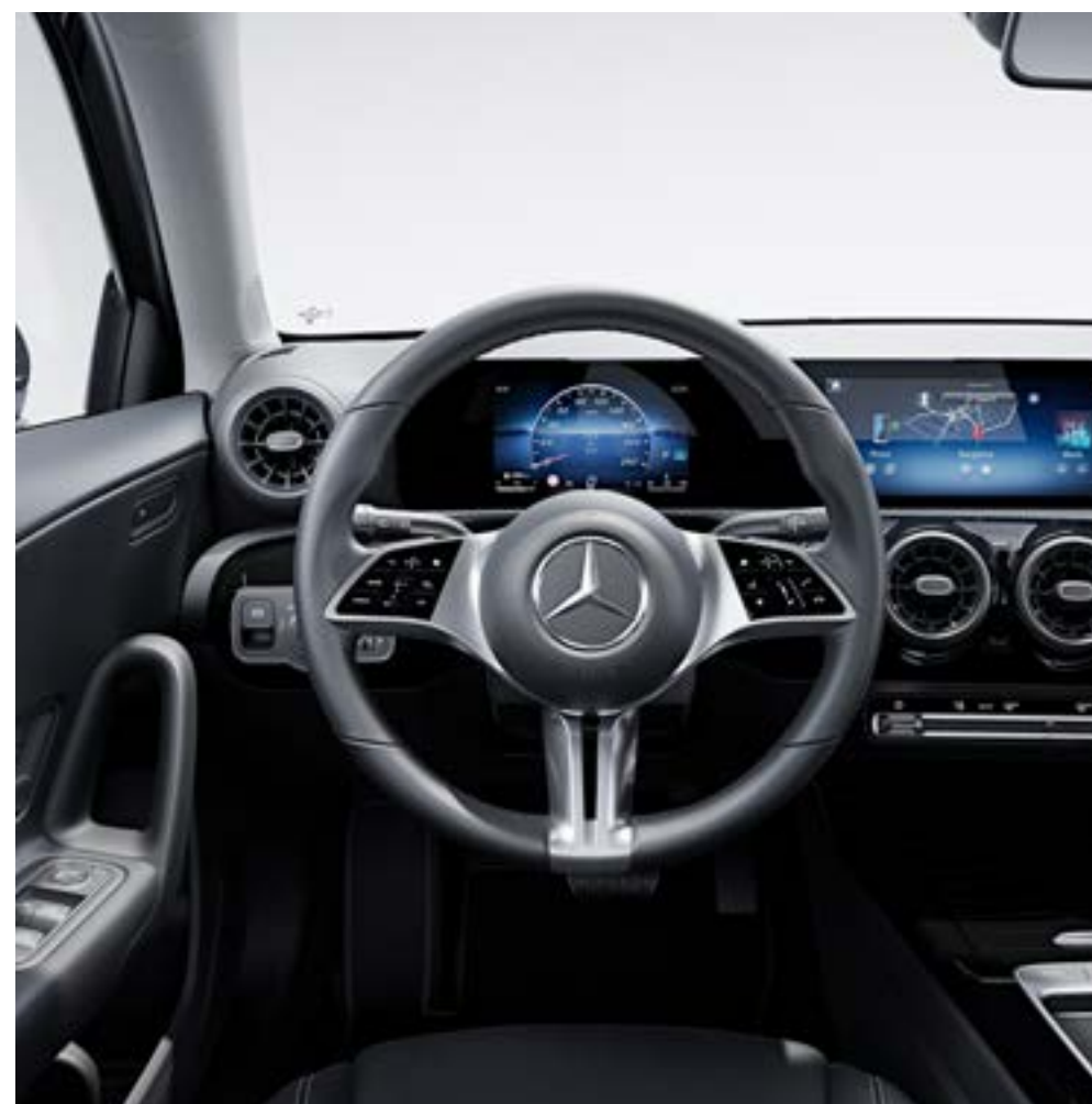
New look multifunction sports steering wheel in leather