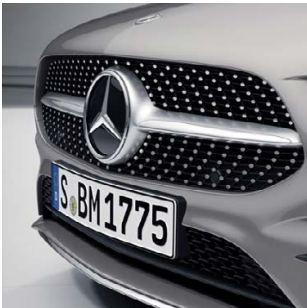
Radiator grille with Mercedes-Benz pattern in high-gloss black and central Mercedes star