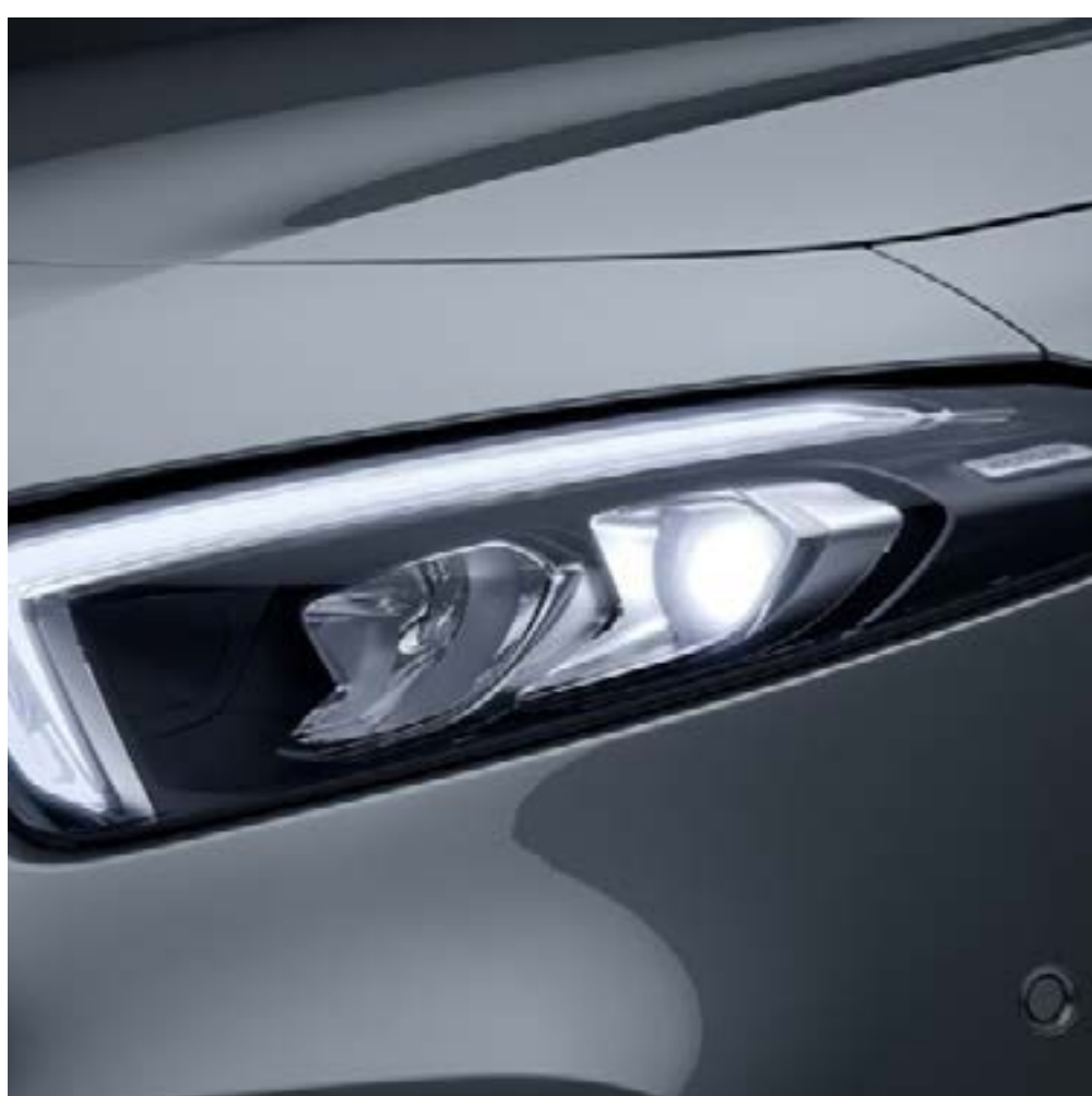
LED High Performance headlamps