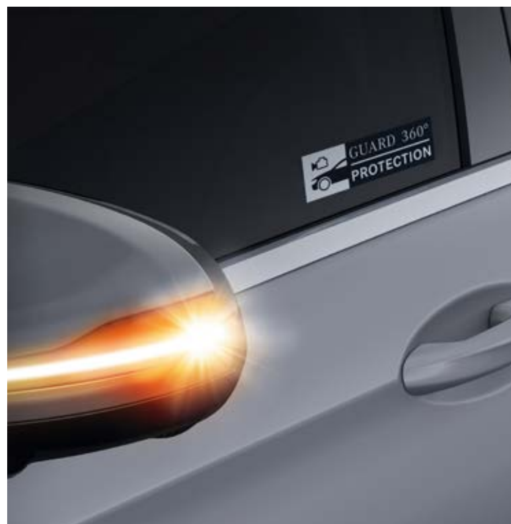
GUARD 360 ° Vehicle protection