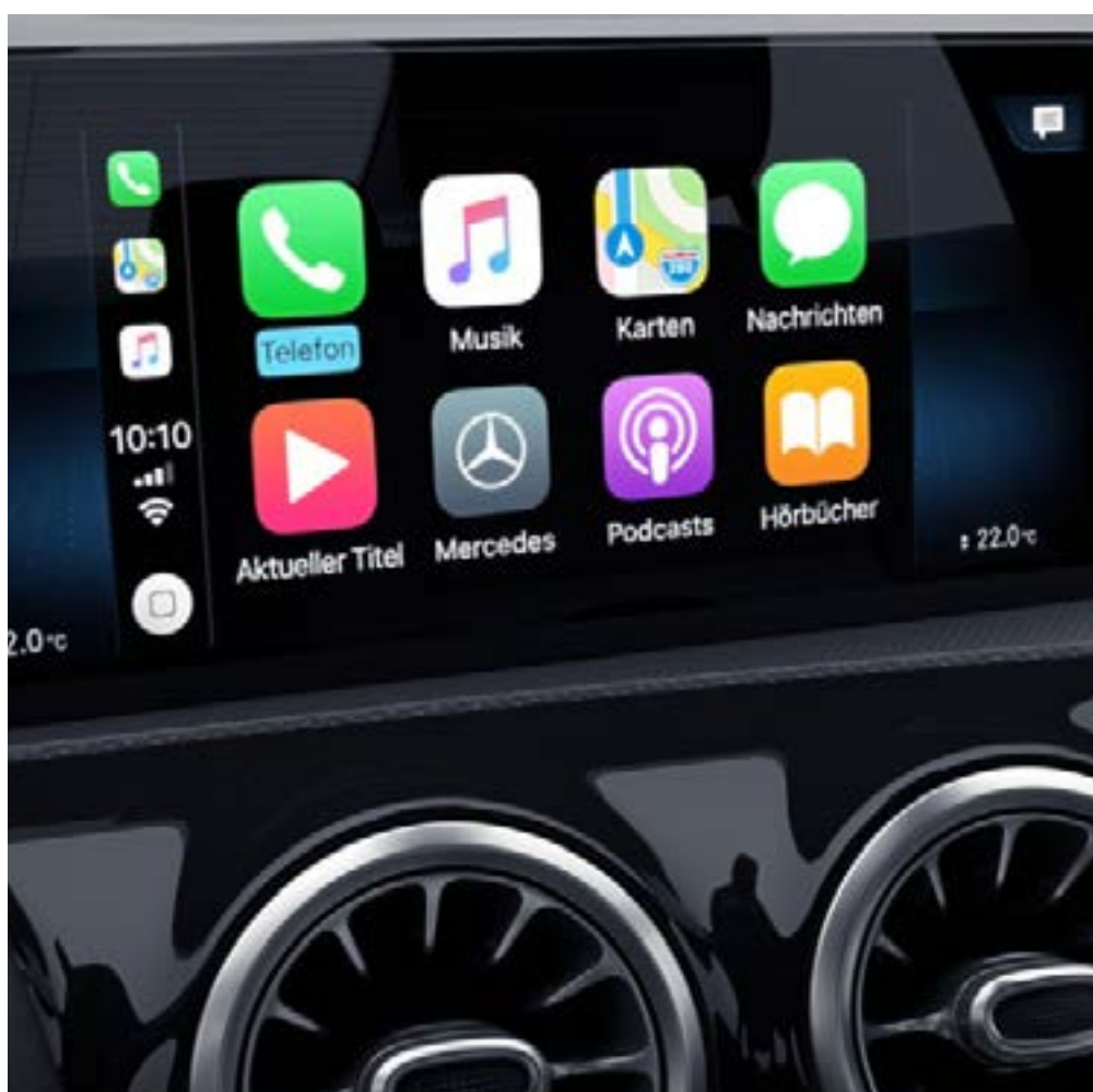
Apple CarPlay™ and Android Auto